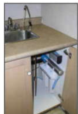
Typical Installation for drinking water under the sink